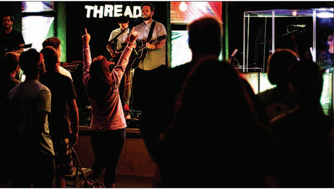
Now in its 14th year, the Youth in Ministry (YiM) Student Leadership Conference at Milligan College featured a stellar line-up of speakers and leaders from around the country to prepare high school students to be servant leaders in their schools, communities and future careers.