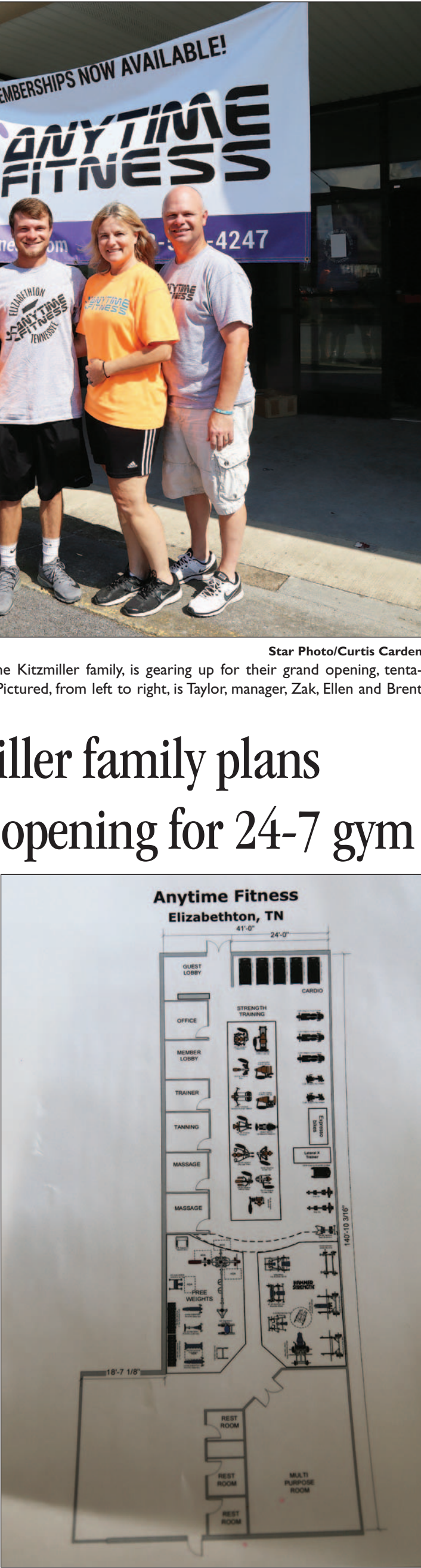
The floor plan for the gym equipment that will be inside the new Anytime Fitness facility.