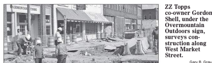
ZZ Topps co-owner Gordon Shell, under the Overmountain Outdoors sign, surveys construction along West Market Street.