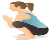
Extended wide squat