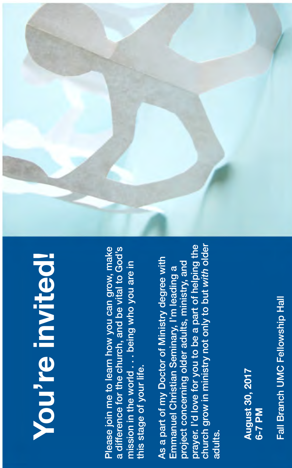
Figure 2. Invitation to congregations