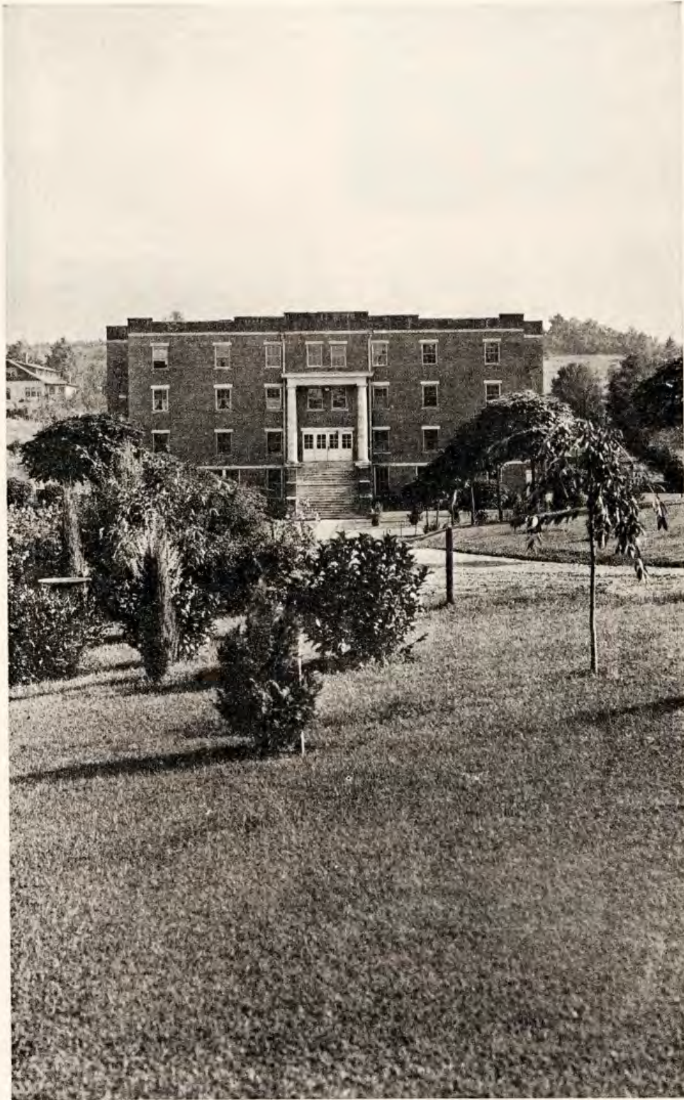
J. O. CHEEK ACTIVITY BUILDING