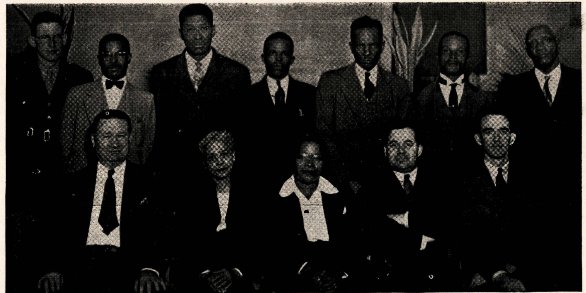
SCHOOL OF THE SACRED SCRIPTURES BROOKLYN, N. Y. CLASS OF 1944

Institute held at A. & I. State College, Nashville, Tenn.