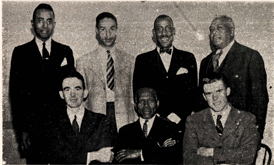
SCHOOL OF THE SACRED SCRIPTURES PARIS, KY. CLASS OF 1944