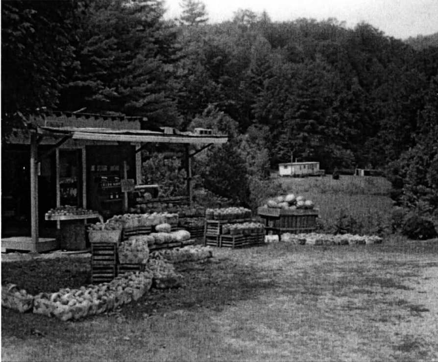
Davis Girls Peach Shed is a seasonal roadside fruit stand off U.S. Highway 19E in Roan Mountain.

Date: Mar 27, 2011; Section: Section L Progress; Page: 4L