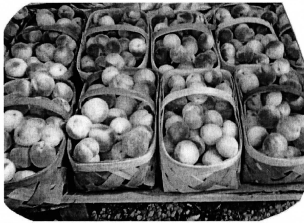
The peaches sold by Davis Girls come from a farm in Chesney, S.C.