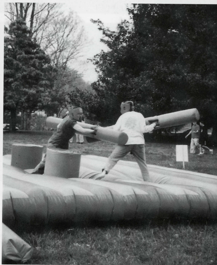
Venting! Two unidentifiable Milligan students battle during Marvelous Monday! It seems that they each had a lot of pent up frustrations.