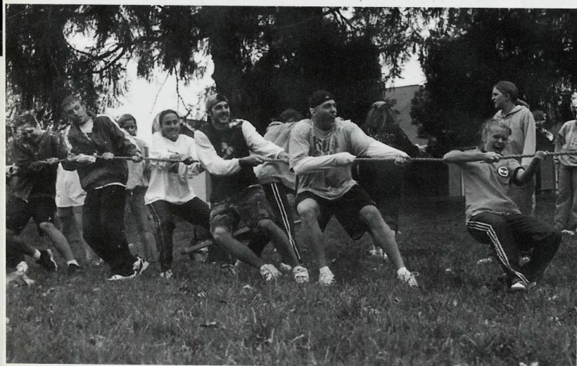
Teamwork! Team members, including basketball and soccer players, work at the tug-of-war on Marvelous Monday. The team was eventually victorious, causing the other team to fly into a pit of slop.