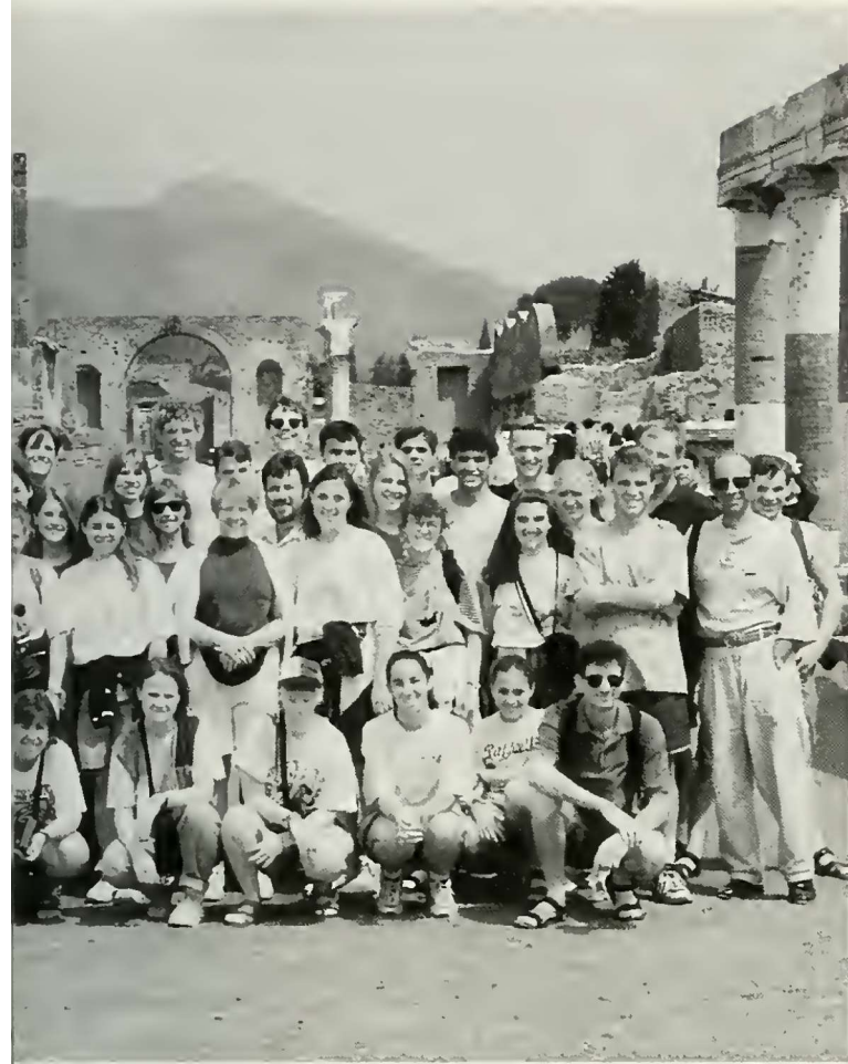
The whole Humanities crew pauses for a photo at Pompeii in Italy. In the background the ruins of Pompeii can be seen, as well as the volcano of Mt. Vesuvius that caused the destruction of this once prosperous community.