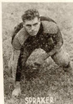
These are the four Milligan Buffaloes who made the 1940 All-Conference Team