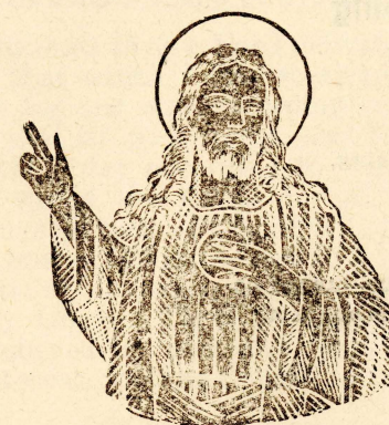
He is risen