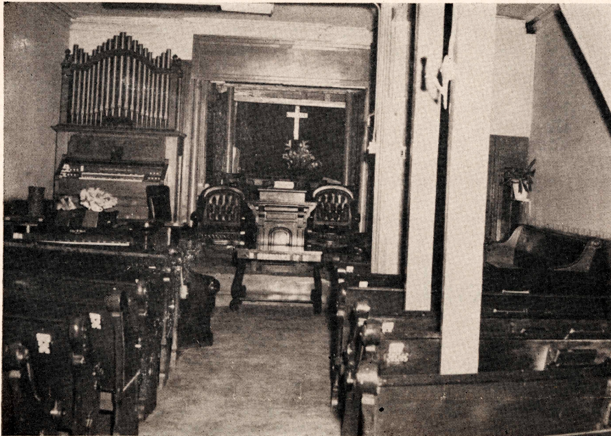
Emmanuel Church of Christ Baltimore, Maryland